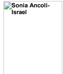
Sonia Ancoli- Israel